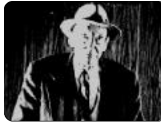
Burroughs from “Facing Beat” Exhibit 1996

Widely Unknown, 2004 DV, work-in-progress