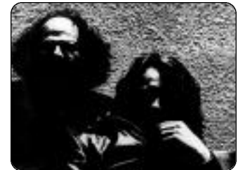
“The Incredible Poetry Reading” 1968 Ginsberg and McClure wait to read.