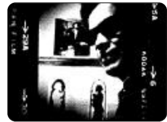
“Night in the Life of Charles Plymell” 1964