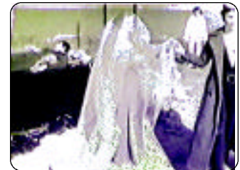
“Kaleidoscope Hamlet, Chicago 1969