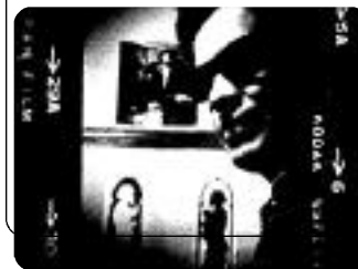
"Night in the Life of Charles Plymell" 1964