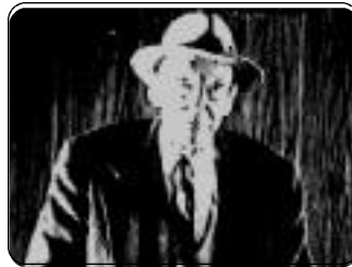
Burroughs from "Facing Beat" Exhibit 1996