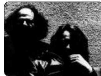
"The Incredible Poetry Reading" 1968 Ginsberg and McClure wait to read.