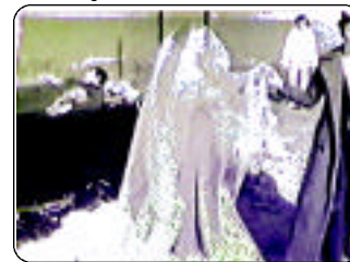
"Kaleidoscope Hamlet, Chicago 1969